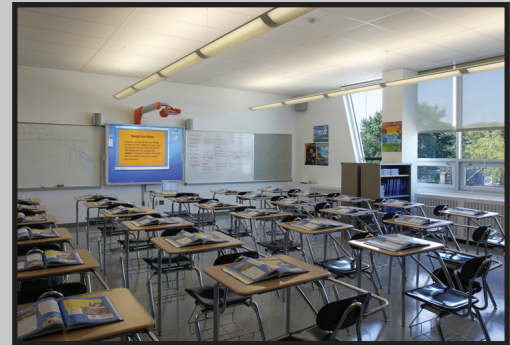
Commodore John Barry Elementary Philadelphia, Pennsylvania LEED® Gold