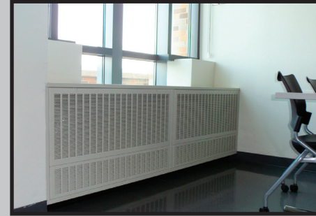
St. John's University D'Angelo Hall Queens, New York