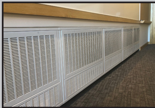
Hudson Valley Community College Troy, New York