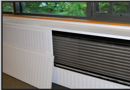
Bridgewater State University Bridgewater, Massachusetts LEED® Silver