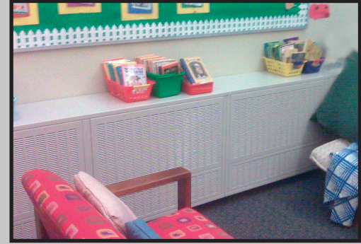
Summit Elementary School Winston-Salem, North Carolina