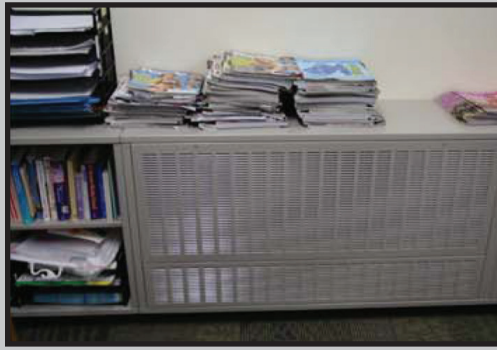
South Education Center - ID287 Richfield, Minnesota LEED® Certified